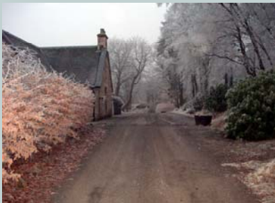
The MIX studios — an artists' dream and a recording musicians playground.

Our aim is to promote new musical talent in and around Scotland whilst providing a fully equipped studio recording facility for all types of bands and artists. Recent projects include The Celtic Park Band, El Padre, and Albannach. Samples of many of our recent projects can be heard at our new website, ( www.mixrecords.com ).